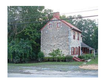
Leesport Lock House